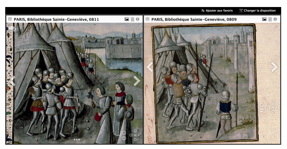
Fig. 3. Two images of miniatures displayed side by side in the Mirador workspace. On the left: Paris, Bibliothèque Sainte-Geneviève, ms. 811, f. 005: Reddition de Valenciennes à Herman, comte de Mons. On the right: Paris, Bibliothèque Sainte-Geneviève, ms. 809, f. 317: Siège de Mayence par les Romains. The two miniatures are attributed to the circle of Willem Vrelant.

This annotation feature makes it possible for the user to save the selected image detail together with its context, both visual and textual, unlike other existing tools, which allow one to select, cut out and export a detail from an image without retaining anything of the original context.