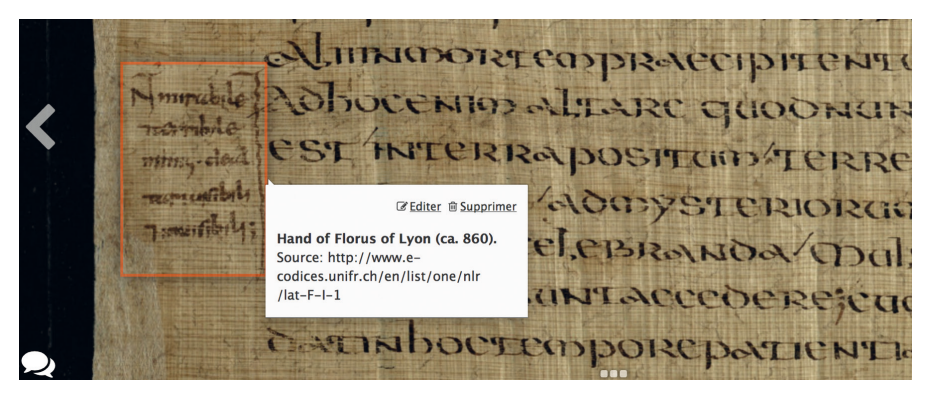
Fig. 1. Marginalia by Florus of Lyon in the manuscript St Petersburg, National Library of Russia, L.F.papyr. L.1, b

trace, identify and index an author's personal annotations (marginalia), as has been highlighted by an experimental study of Florus of Lyon's annotations<sup>26</sup>