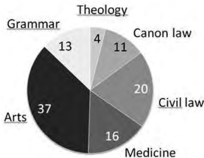
Number of teachers in the different disciplinary areas in the rotulus of 1514.

viction in a bull of September 20, 1514. Rejoicing at the sudden and extraordinary flowering of the Studium that took place following the provisions of 1513, the pope attributes it to the fact that it was richly funded, and that precise rules for the administration of the budget have been established 45 . With a similar commitment, he now intends to restart work on the Palazzo della Sapienza: most of this second bull is dedicated to this topic. But the most representative monument of Leo X's university policy is the rotulus professorum for the year 1514. The role is the result and the implementation tool of a grandiose project of restoration of the Studium Urbis 46 . We can not dwell on this document here: a first impression can be obtained if one compares the funding of the professorships in 1514 and in the years of Sixtus IV: the number of teachers is almost the same (101 in 1514 and, e.g., 107 in 1473-1474); but while with Sixtus IV, as far as we know, the budget never exceeded 3,000 florins, in 1514 it amounts to 12,250 florins. As regards the role of Leo X, the graphs below allow to evaluate the criteria by which salaries were established in the various disciplinary areas: