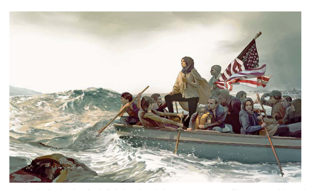
Image 8: This land is their land , digital work made by Owen Freeman to illustrate an article on the situation of refugees and migrants in 2017<sup>64</sup>.

Understood as such, the painting by Leutze is seen as a "master mediation" <sup>63</sup>, as an unavoidable referent to represent the patriotism during the mythical moments of the foundation of the United States. A way of remembering that is light and instantaneous, that has been used in many occasion during those years, transforming the image's superficiality but maintaining the basic icons that manage to identify the resulting image with the original one, for example as in these images digitally created.