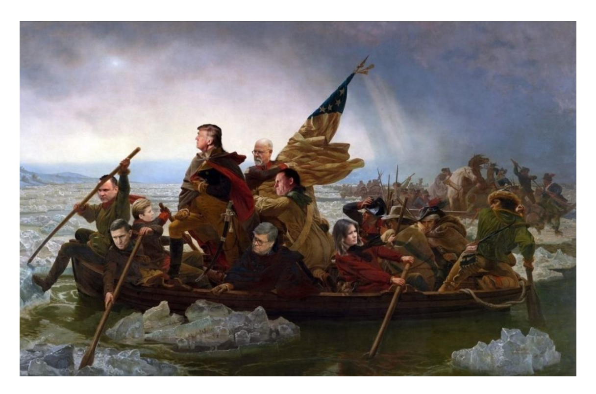
Image 5: Meme created by anonymous supporters of Donald Trump to extol the comparison with the first president of the United States <sup>60</sup>.