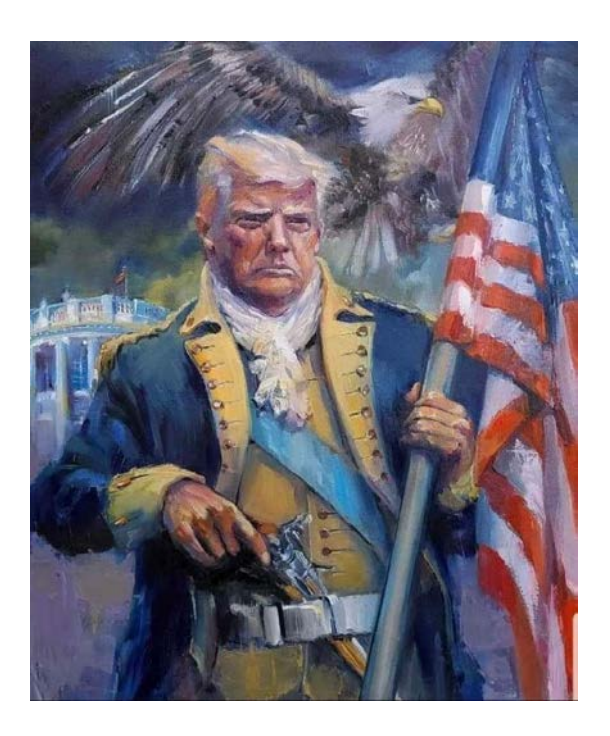
Image 1 : Image created via digital media and shared in social network Twitter by the Republican Party of Arizona on the 29<sup>th</sup> of December, 2020.

that characteristic of special relevance for the contemporary virtual image and its relationship with the past: