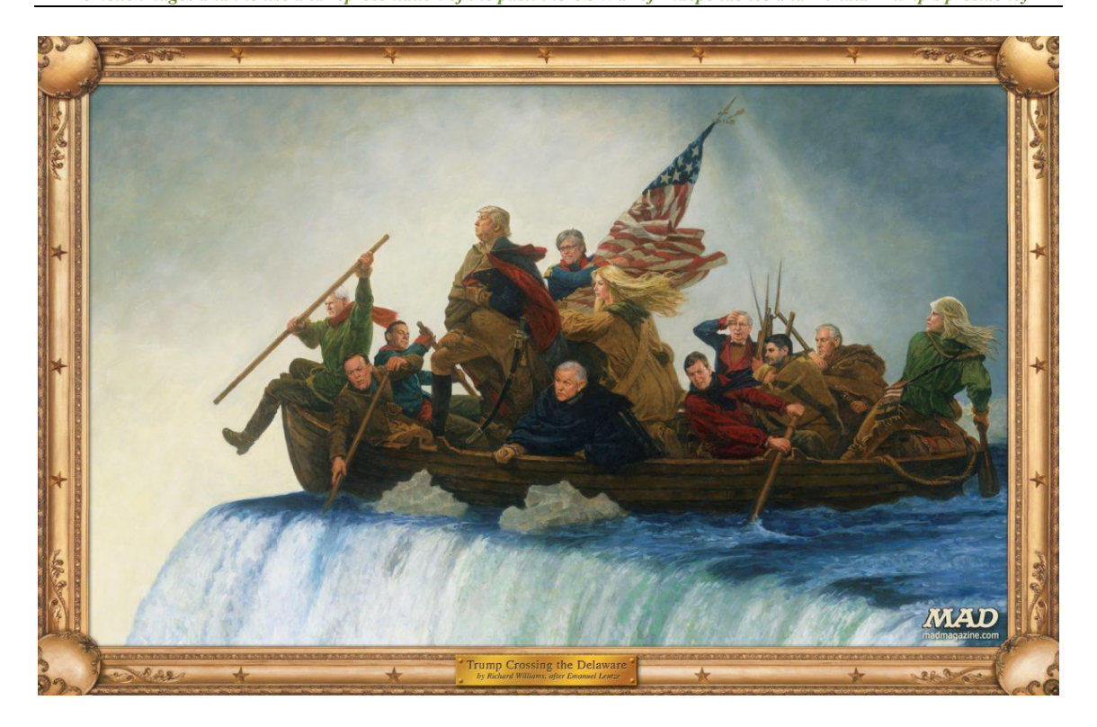
Image 7: Image published in the satire magazine MAD as a criticism to the government of president Donald Trump.

This leads to a strictly visual conversation around the use and representations of the past via the reproduction and manipulation of virtual images. A debate that, in this case, revolves around two poles: legitimisation and criticism. All of this based on a visuality easily recognisable by all its potential recipients, who are able to recognise immediately the underlying memory discourse of those images, capturing their attention and facilitating their reproduction. We must once again reiterate that what is being reproduced are the most obvious elements of the moment represented, unburdened from any depth, without context, lightened up. A representation and use of the past that must be related to the "aesthetic memory",