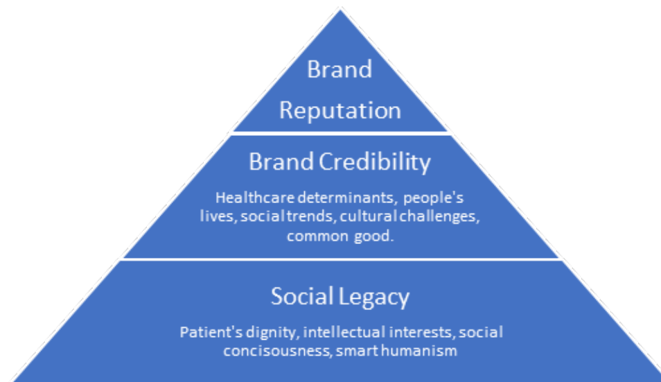
Figure 2. Hospitals' Reputation Process